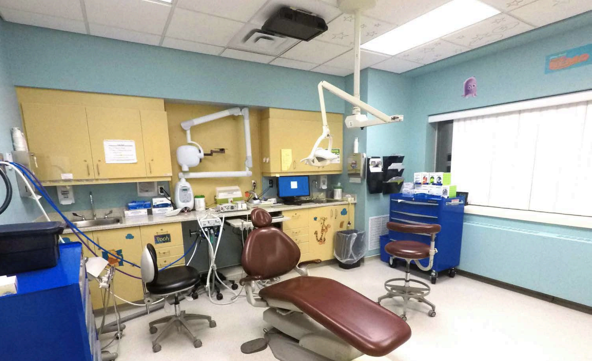
the Finding Nemo Room,